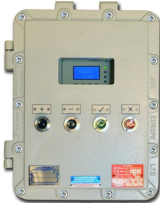
Kemtrak DCP007 industrial photometer housed in an ATEX EExD zone 1 explosion proof enclosure