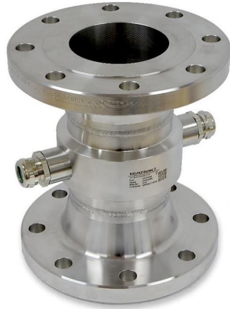
Kemtrak 4" ANSI ASME B 16.5 150lb RF 316L zero maintenance industrial fiber optic measurement cell.

The Saybolt color scale traditionally relies upon matching a standard colored disc viewed through an adjustable volume of sample. This one dimensional color scale is prone to operator bias and error due to slight variations in the way different operators will perceive color. In essence, color is simply how our brains respond to different wavelengths of light and such a process can be standardized and automated using a Kemtrak DCP007 photometer.