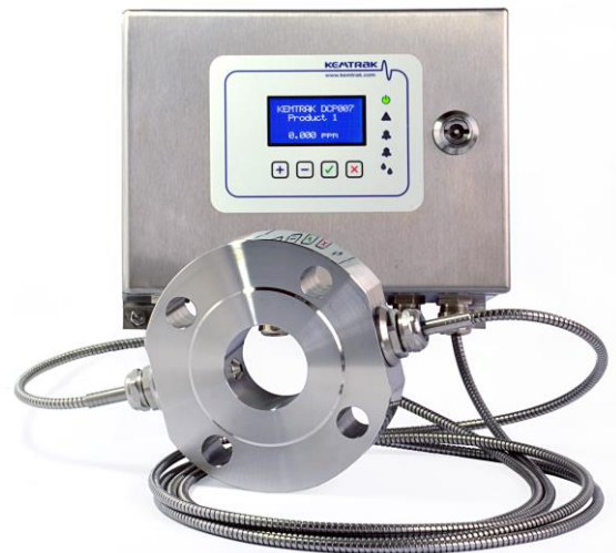
Figure 3: Kemtrak DCP007 NIR photometer with DIN DN50 measurement cell.

Turbid emulsions are accurately measured using the reference wavelength of a Kemtrak DCP007 NIR photometer, allowing both dissolved and suspended water to be monitored. Alternatively, a Kemtrak TC007 turbidimeter is suitable for monitoring water at concentrations above the solubility point. The instruments are calibrated in units of ppm water, providing an accurate measurement of the water content of the sample.